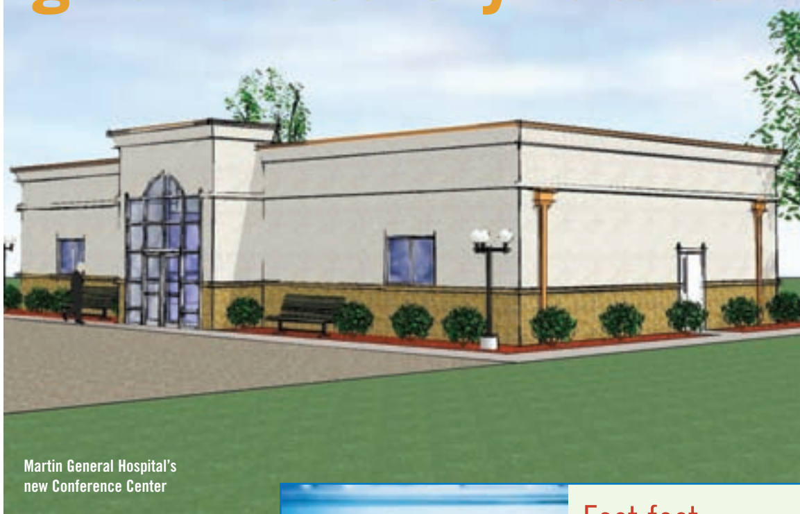
Martin General Hospital's new Conference Center

A Grand Opening Celebration is scheduled for the beginning of 2007. Please keep watching as we continue to grow!